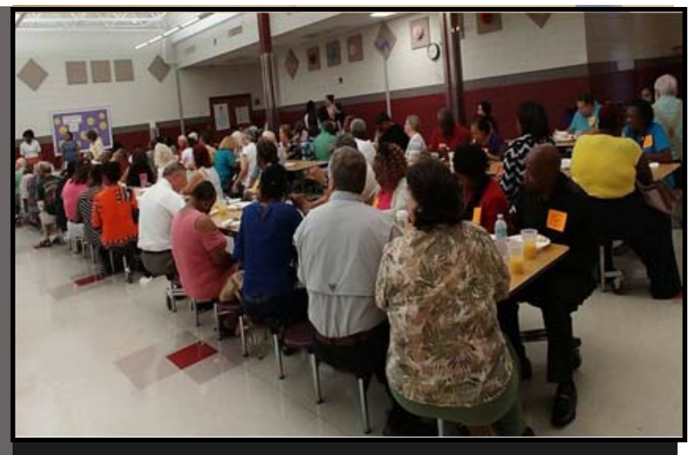
Parents receiving valuable information at a school's parent night

Additionally, the Federal Programs department will provide training to principals so principals will understand parent and family engagement requirements and plan opportunities for family engagement activities and meetings for the remainder of the school year.